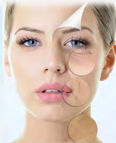
Deep cleansing & heath whitening